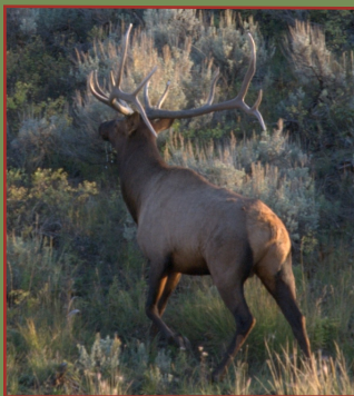
Wasatch Mountain Bull Elk

Cow Elk hunting in the Book Cliffs or the Wasatch Mountains is a draw hunt. These are really fun Cow Elk hunts and you usually get to see some nice Bulls too. The Wasatch Mountains Unit is one of the few areas in the state where you potentially have the opportunity to hunt both Cow Elk and Buck Mule Deer at the same time. These are great hunts if you are a meat hunter. Call and let us help you get your application in on time.