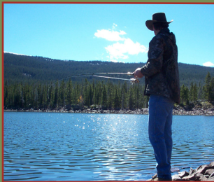
Fishing in the Uintas

sit between 10,000 and 12,000 feet in elevation. These trips offer world class fishing for fish like