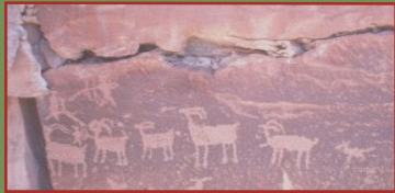
Petroglyphs in Nine Mile Canyon

Photograph walls of petroglyphs and see the country the local Native Americans called